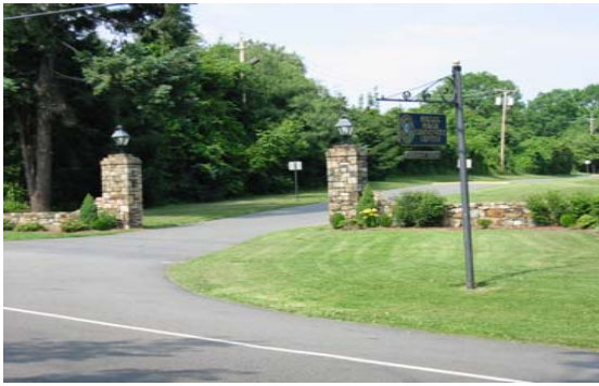
Entrance to community center and pool